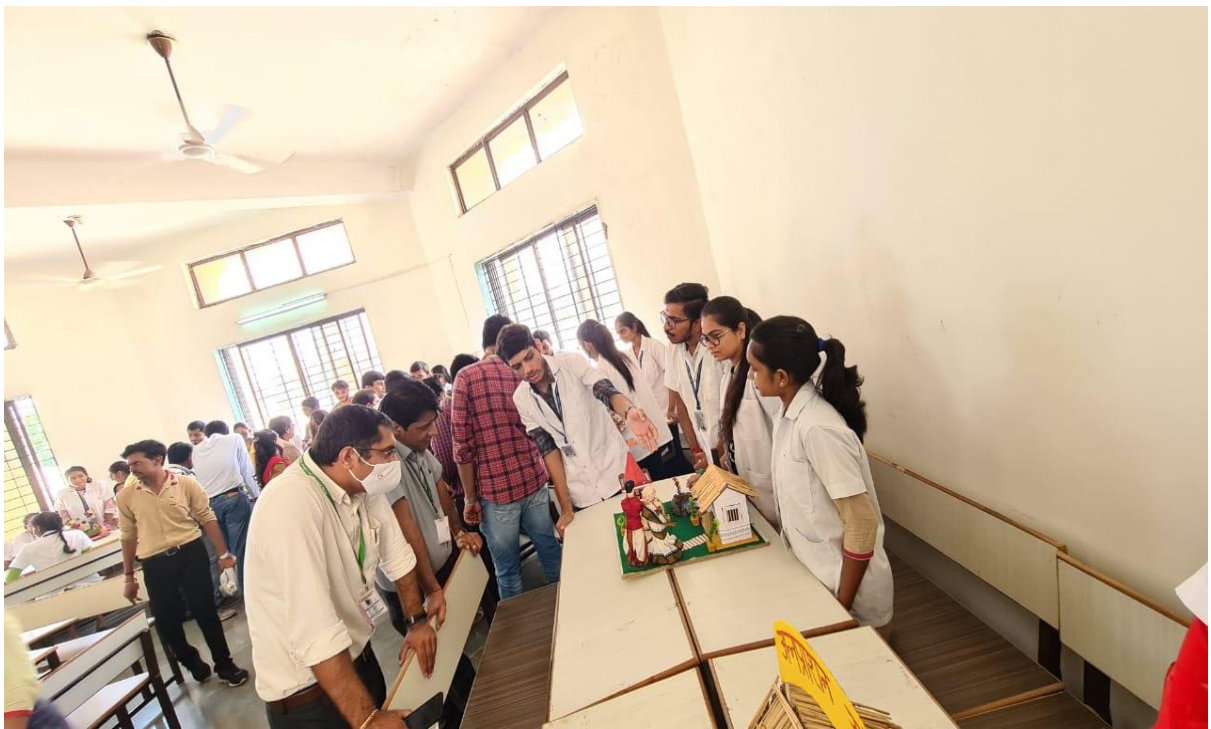
PRESENTATION OF MODELS BY THE STUDENTS