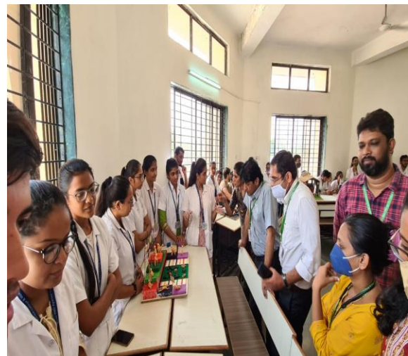
PRESENTATION OF MODELS BY THE STUDENTS