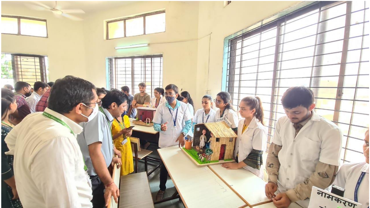
PRESENTATION OF MODELS BY THE STUDENTS