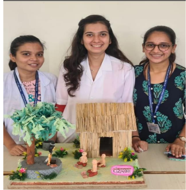
STUDENTS WITH THEIR MODELS