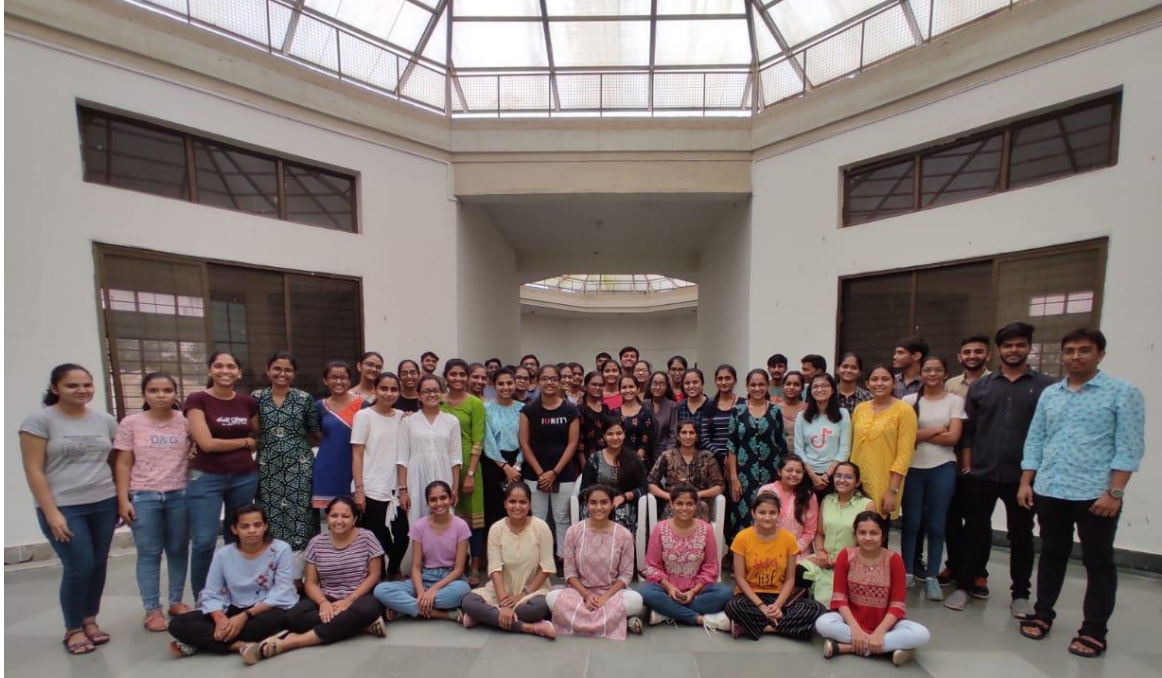
STUDENTS WITH KAUMARABHRITYA FACULTIES