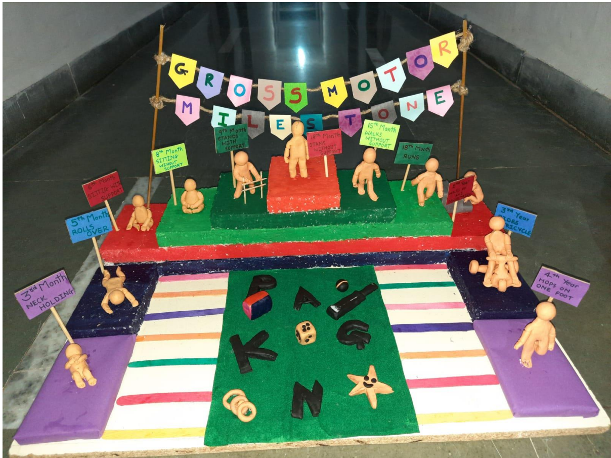
GROSS MOTOR MILESTONE