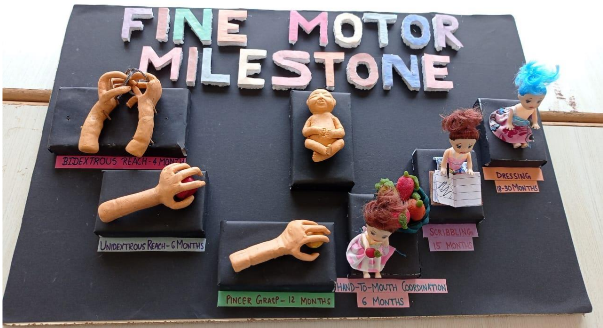
FINE MOTOR MILESTONE