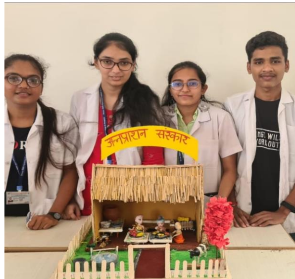
STUDENTS WITH THEIR MODELS